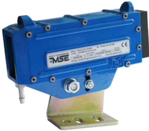
The MSE-HMD84 Digital Hot Metal Detector shown mounted on a supplied MSE-LH01 "L" Mounting Bracket.